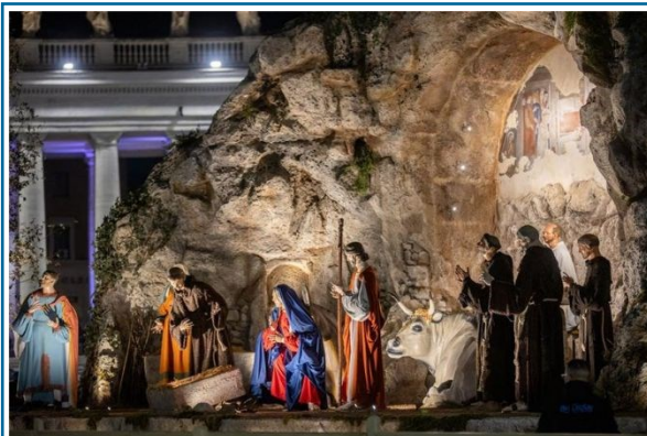
The Vatican unveiled its annual Nativity scene on Dec. 9, 2023, paying special tribute to the origins of the beloved tradition on its 800-year anniversary.

Full Story: National Catholic Register Holy Father's Apostolic Letter ,